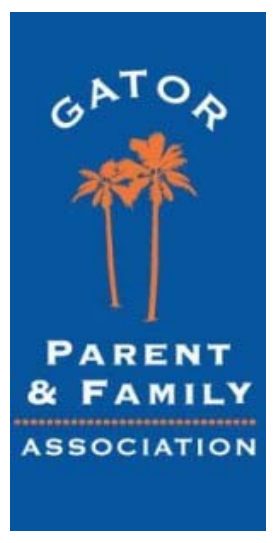
The Gator Parent and Family Association is open to all family members of UF undergraduate students.

Membership is free, but in order to take full advantage of the benefits, you do have to activate your membership by clicking <a href="here">here</a>.